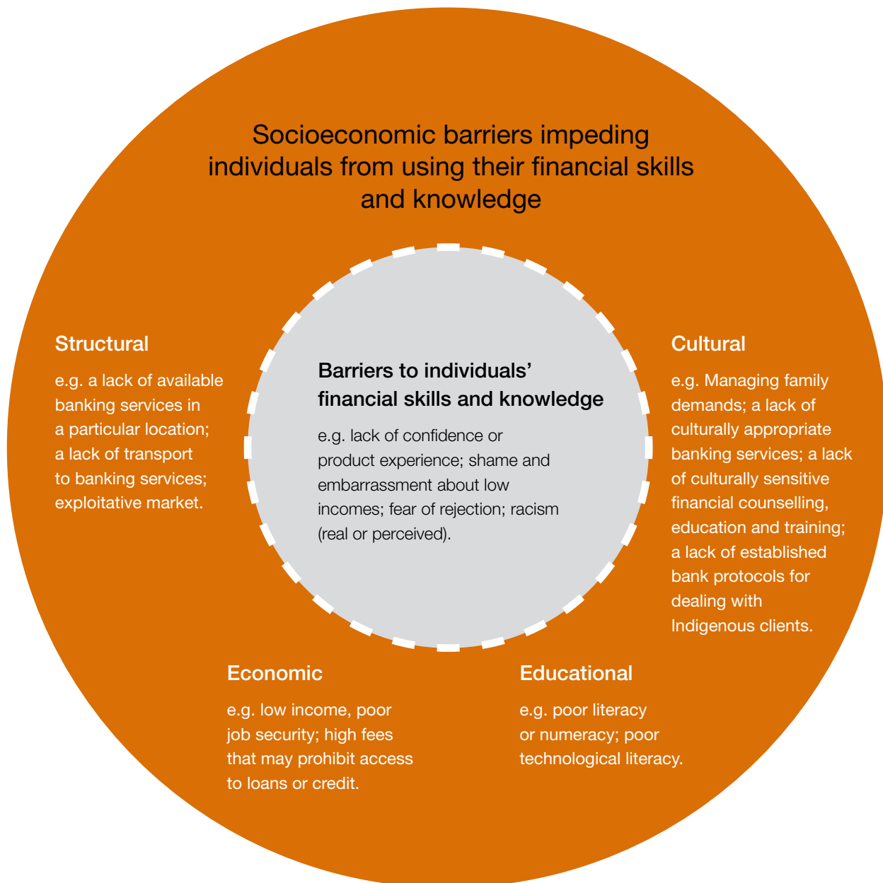
FIGURE 1 ADAPTED FROM 'A FRAMEWORK FOR UNDERSTANDING FINANCIAL CAPABILITY' LANDVOGT, K. (2008, PAGE 84), AND 'FACTORS CONTRIBUTING TO POOR FINANCIAL LITERACY' HIGHLIGHTED IN THE NIMMA REPORT (2006, PAGE 8)